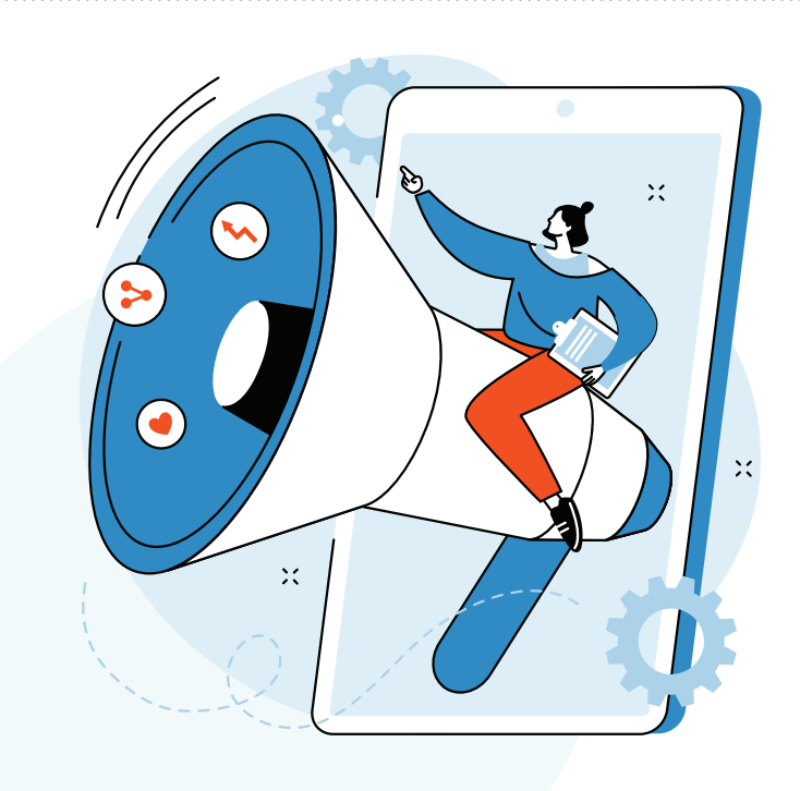
It's important to note that you can use different social networks for different purposes.

Understanding general social media trends is helpful, but you should also conduct your own research about your customers. How do they find you and where do you interact with them most frequently?